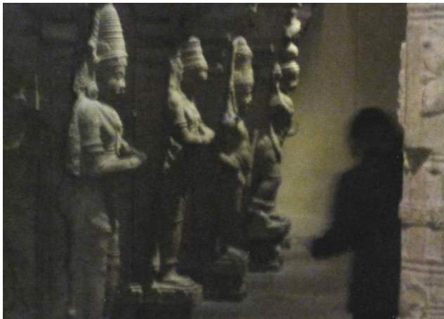
Longing: The Dark One's Residence in the Beloved.